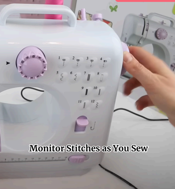
Monitor Stitches as You Sew