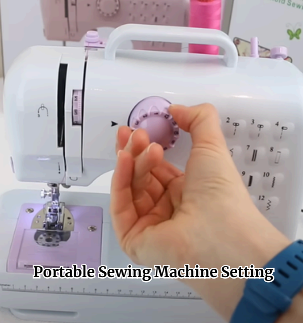
Portable Sewing Machine Setting