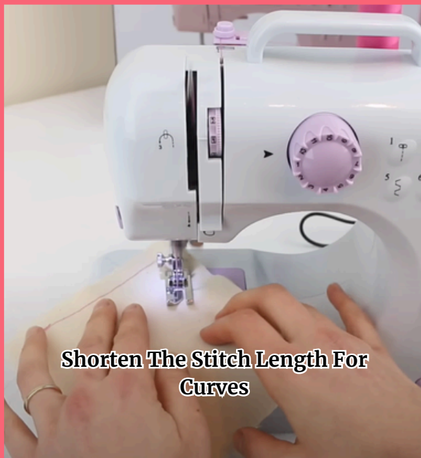
Shorten The Stitch Length For Curves