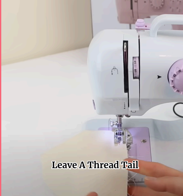
Leave A Thread Tail