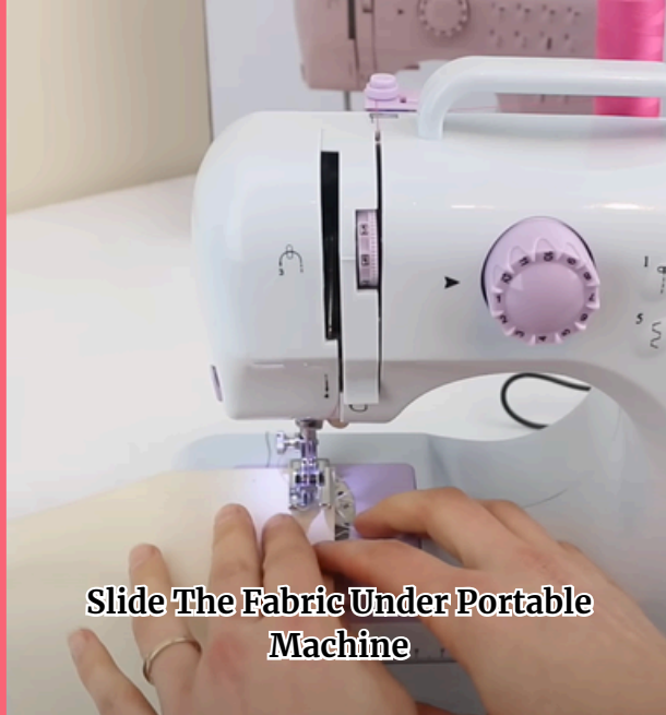
Slide The Fabric Under Portable Machine