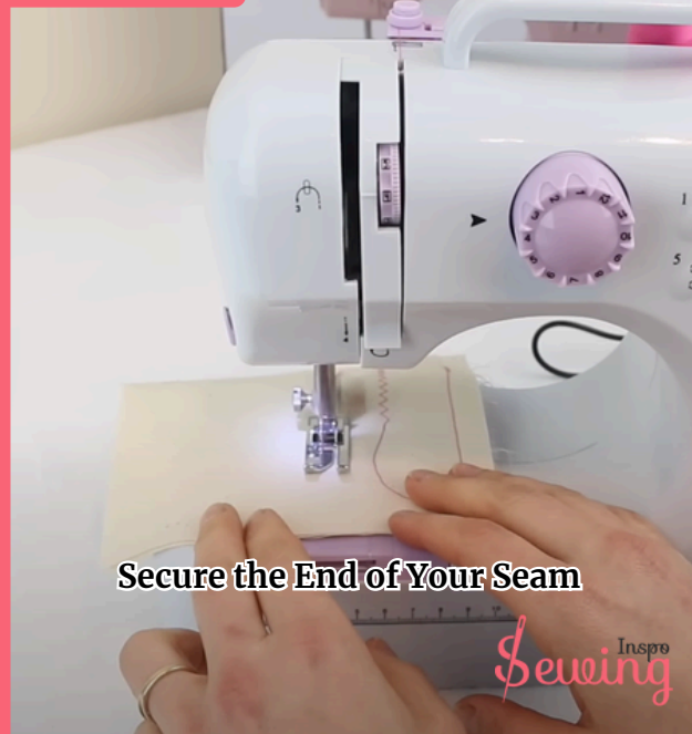
Secure the End of Your Seam