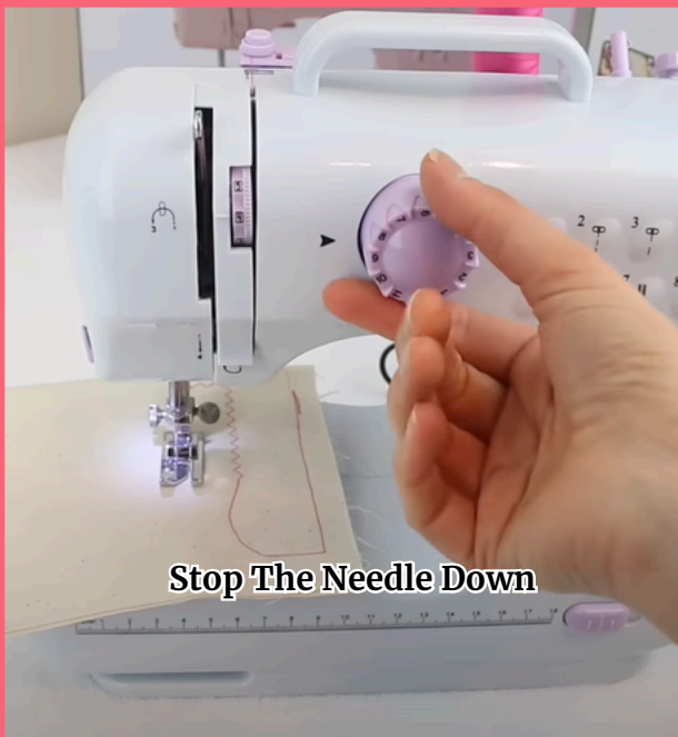
Stop The Needle Down