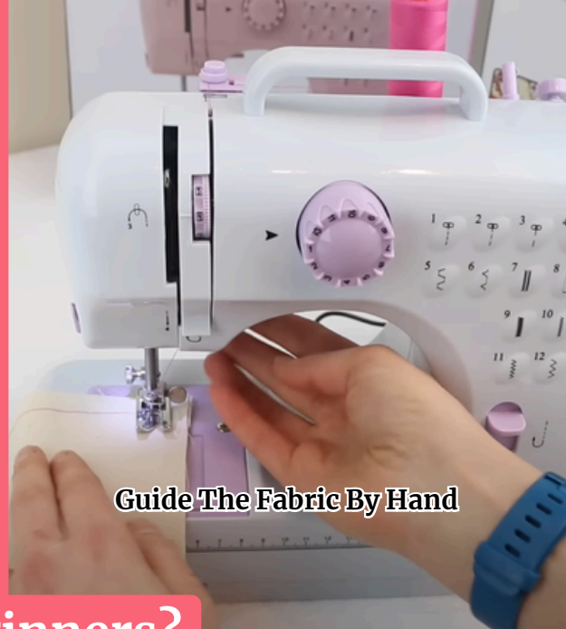
Guide The Fabric By Hand