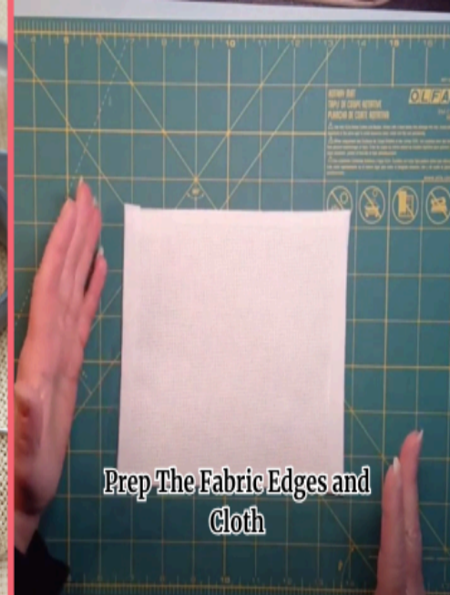
Prep The Fabric Edges and Cloth