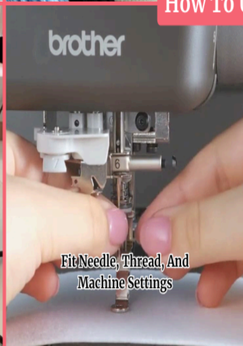
Fit Needle, Thread, And Machine Settings