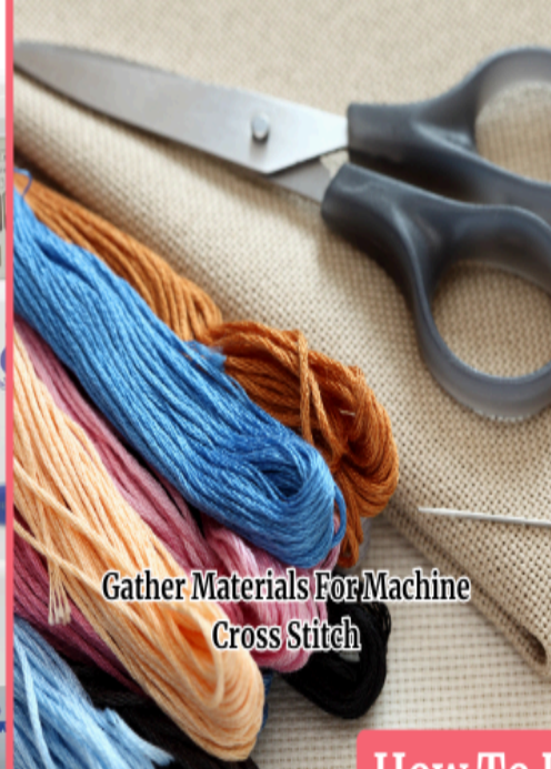
Gather Materials For Machine Cross Stitch