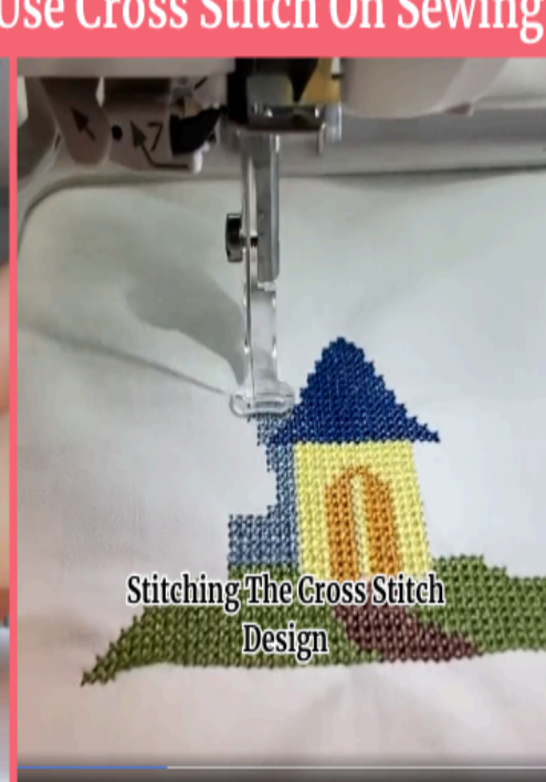
Stitching The Cross Stitch Design