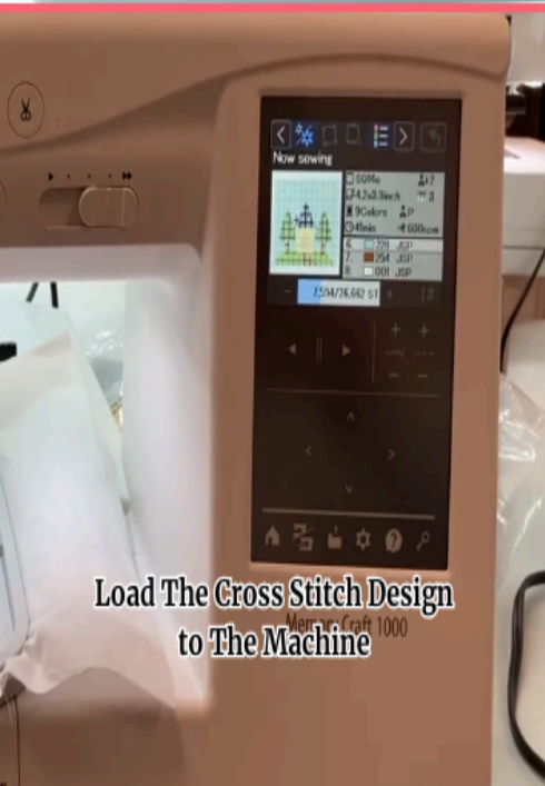
Load The Cross Stitch Design to The Machine