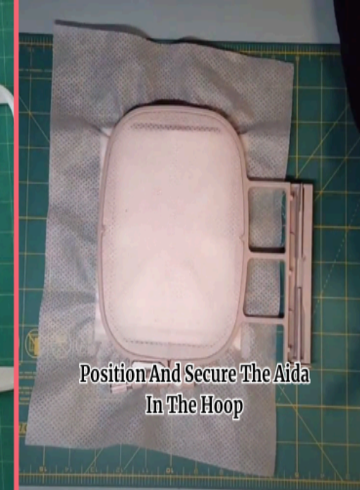
Position And Secure The Aida In The Hoop