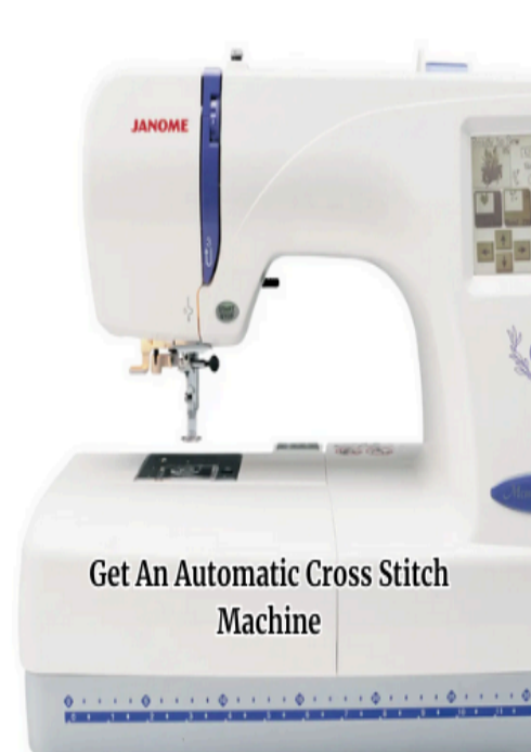
Get An Automatic Cross Stitch Machine