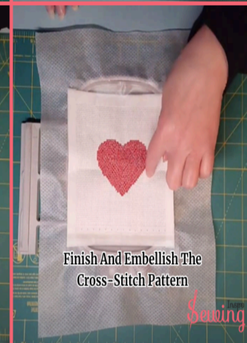
Finish And Embellish The Cross-Stitch Pattern