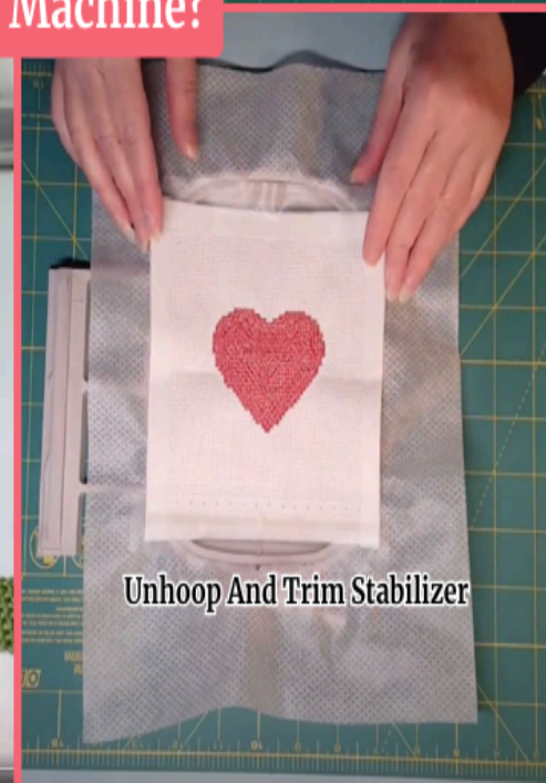
Unhoop And Trim Stabilizer