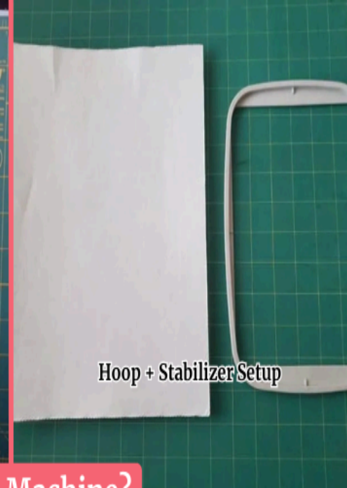
Hoop + Stabilizer Setup