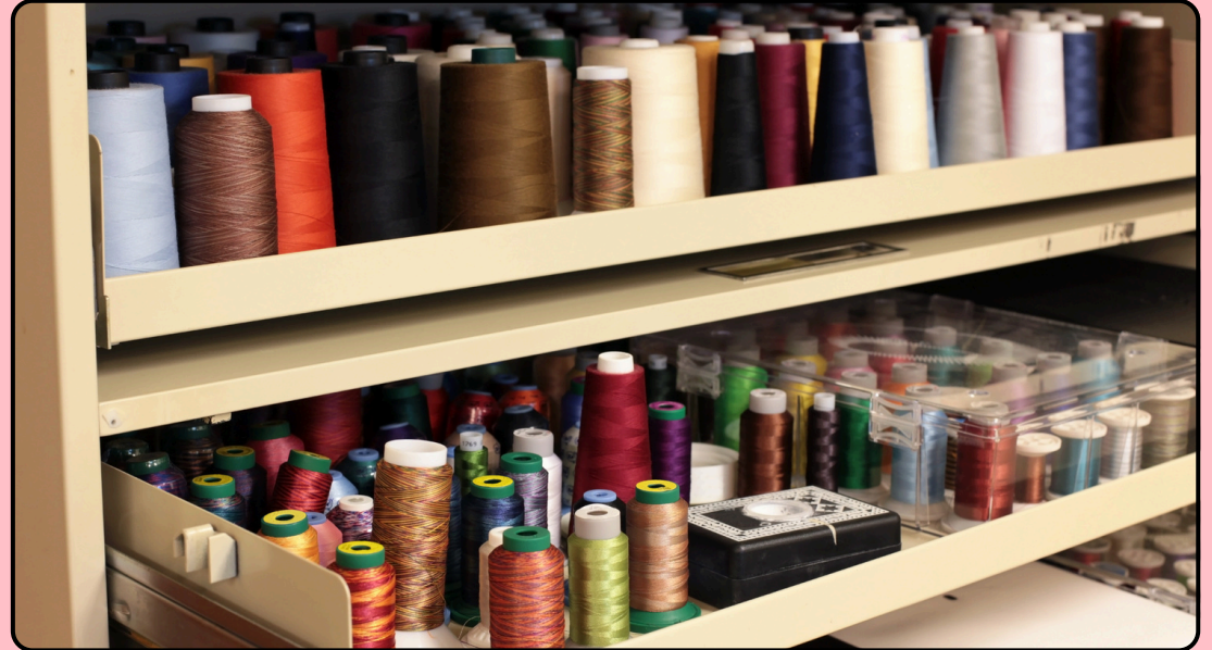
Rayon and Cotton Thread