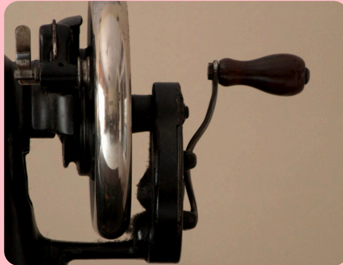
I Turn The Handwheel Again, So It Goes Back Up