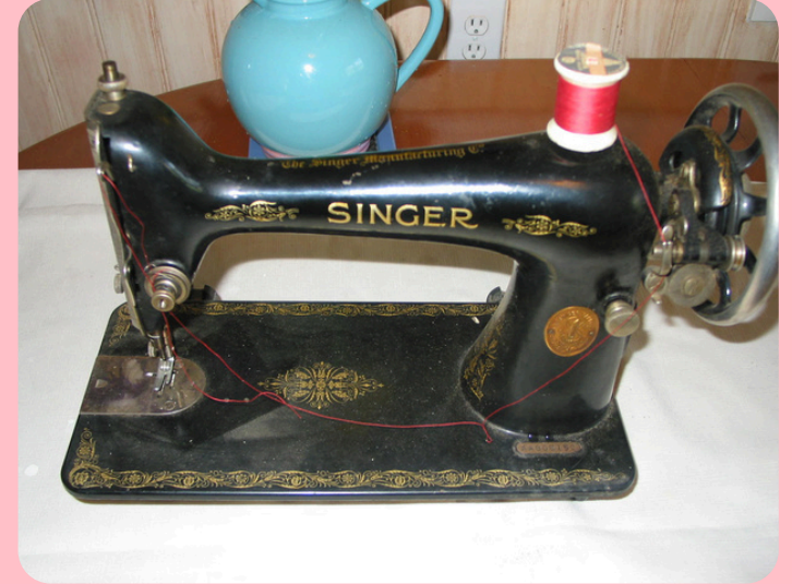
Turn The Handwheel Toward Me