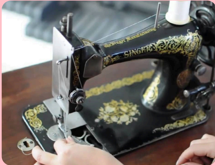
Until the needle dips down right at the edge of the petal