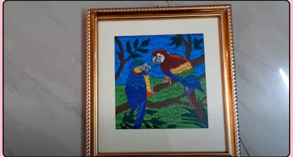
Fill Stitch (Tatami Stitch)