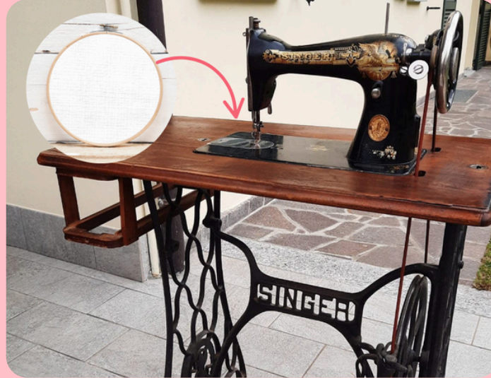
Position Your Starting Point