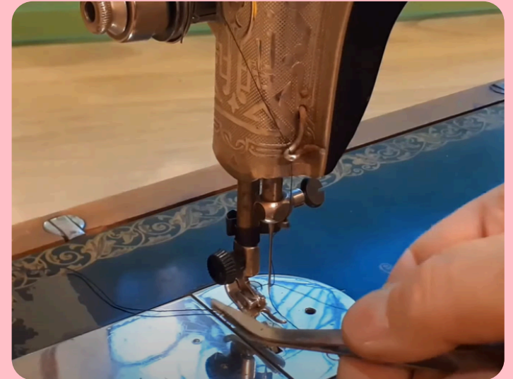
Grab Those Two Tails And Pull Them Toward The Back