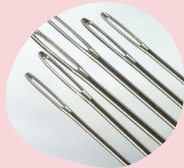
Size 24 Chenille Needle