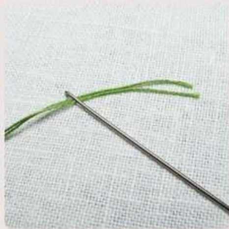
16-count Aida: Use 2 strands