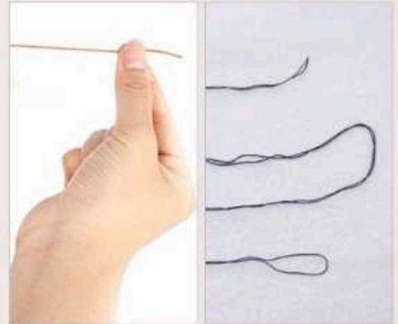
18-count Aida: Use 1 or 2 strands

How Many Threads For Cross Stitch Back Stitch?